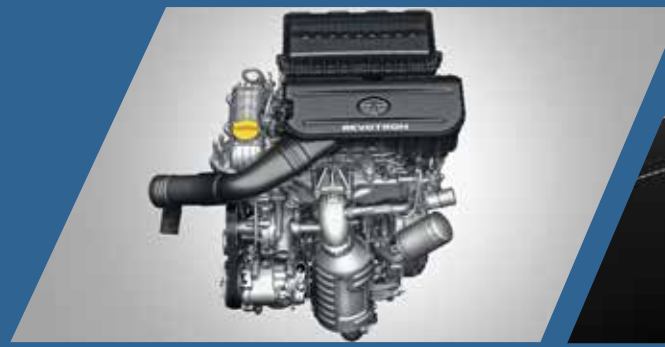
Max Power-86 ps @ 6000 r/min

Who says a peppy drive can't be thrilling? The Advanced AMT Transmission of Tiago lets you zip through any road without shifting a gear. The 1.2 L Revotron BS6 Ph2 petrol engine with the power of 86 ps @ 6000 r/min gives you an all-round performance.