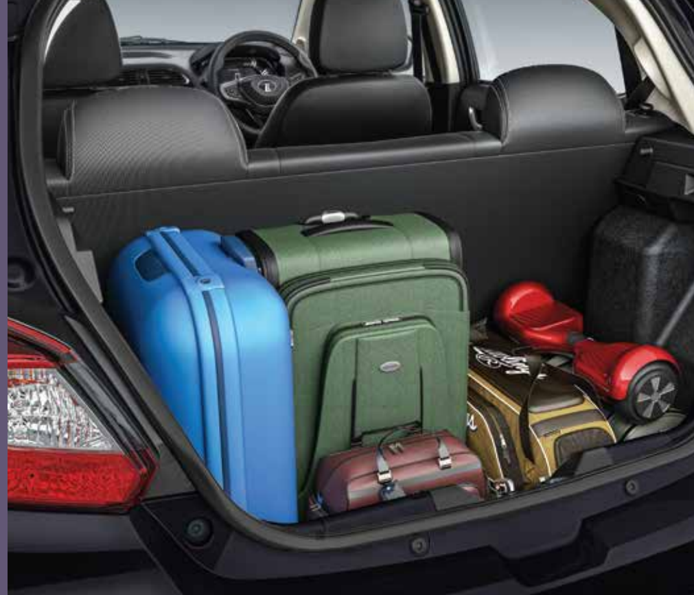
242 l Boot Space