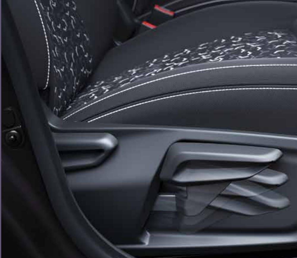
Height Adjustable Driver Seat