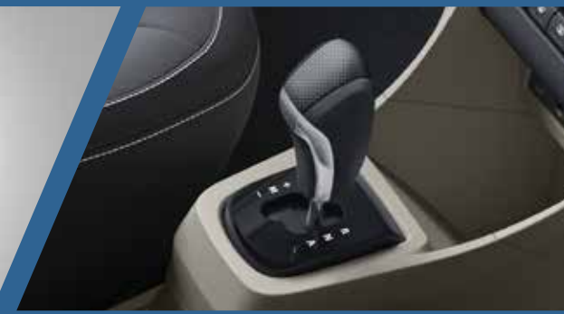
Advance AMT Transmission