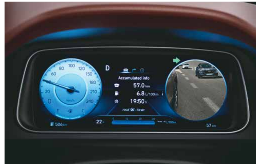
Blind view monitor (BVM)

Each element of the Hyundai ALCAZAR has been designed to provide excellence, in comfort and in safety. Complete with highly accurate front & rear parking sensors and state-of-the-art security alerts like speed alert system, you're always one step ahead of unexpected events on the road. Each journey in the Hyundai ALCAZAR inspires awe and admiration as it carries passengers in uncompromised safety.