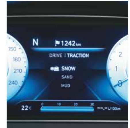
Traction control modes