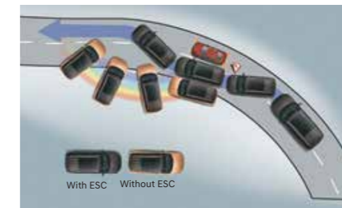
Electronic stability control (ESC)