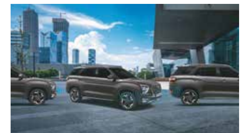
Parking assist: Front and rear parking sensors

Other features: Emergency stop signal | Speed alert system | Speed sensing auto door lock | Driver rear view monitor Impact sensing auto door unlock | Child seat anchor (ISOFIX) | Electric parking brake with auto hold