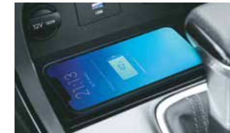
1 st & 2 nd row smartphone wireless charger