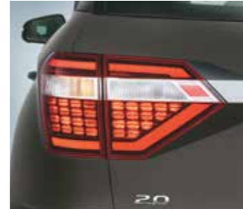
Honey-comb inspired LED tail lamps