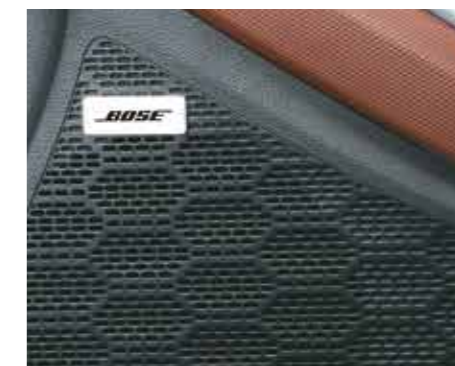
Bose premium sound system (8 speakers)