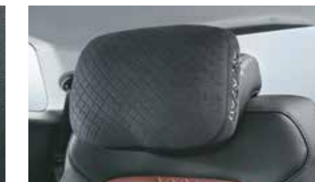
2 nd row headrest cushion