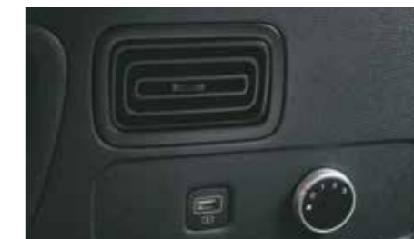
3 rd row AC vents with speed control (3-stage)