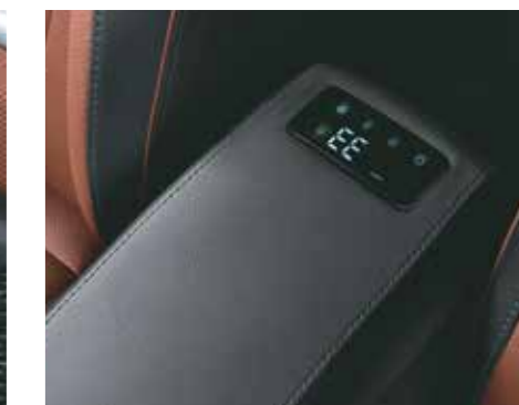
Auto healthy air purifier with AQI display