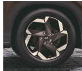
R18 (D=462 mm) Diamond cut alloys