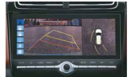
Surround view monitor (SVM)