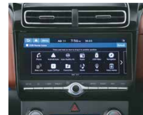
26.03 cm (10.25") HD touchscreen system