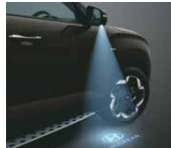
Puddle lamps with logo projection