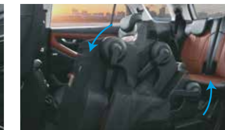
2 nd row - one touch tip tumble captain & split seats