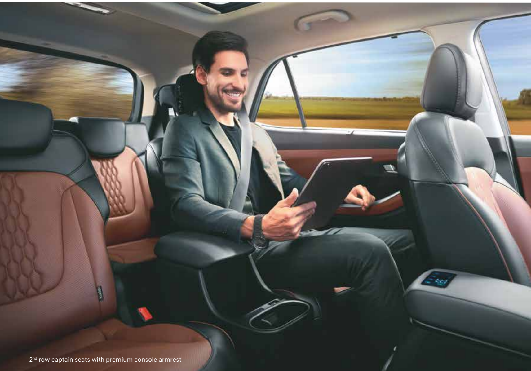
2 nd row captain seats with premium console armrest

Adore your private palatial retreat on wheels wherever the journey takes you.