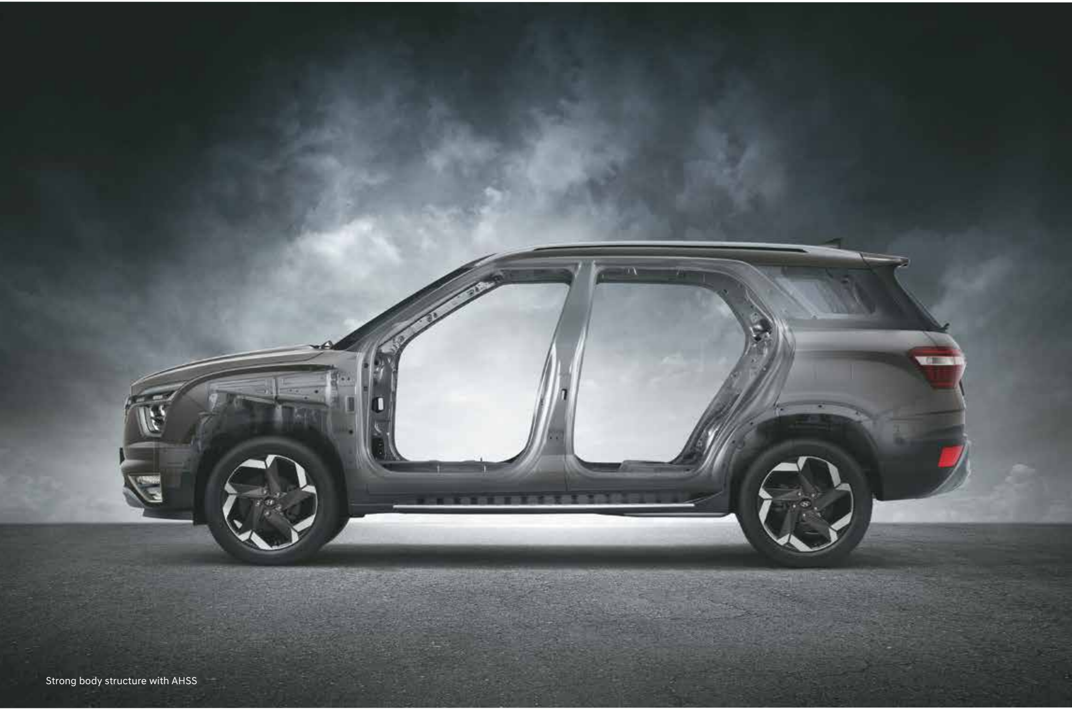
Strong body structure with AHSS