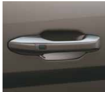
Dark chrome exterior finish outside door handles

Other features: LED positioning lamps | Crescent glow LED DRLs | Trio beam LED headlamps Dark chrome exterior signature cascading grille | LED fog lamps