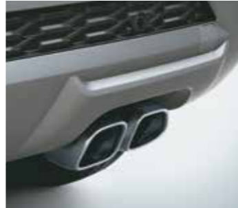
Twin tip exhaust