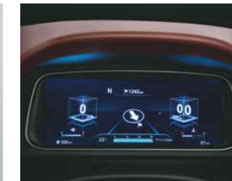
26.03 cm (10.25") Multi display digital cluster with personalized themes