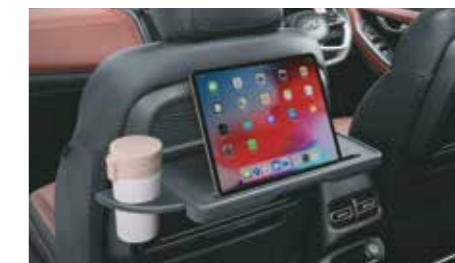
Front row seatback table with retractable cup-holder and IT device holder