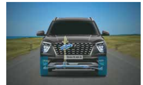
Vehicle stability management (VSM)