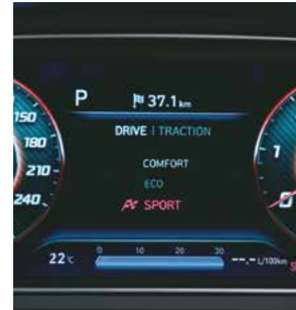
Drive mode select