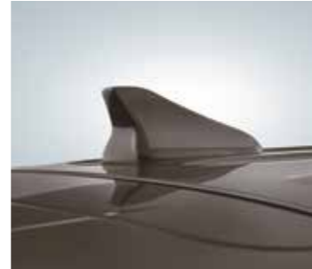
Shark fin antenna