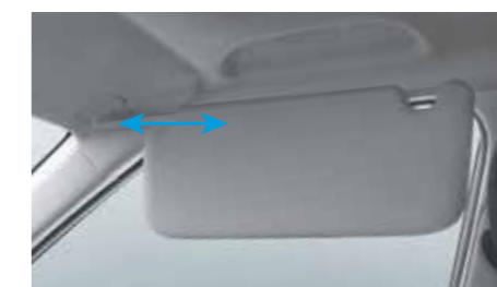
Front row sliding sunvisor