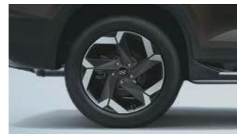
Rear disc brakes