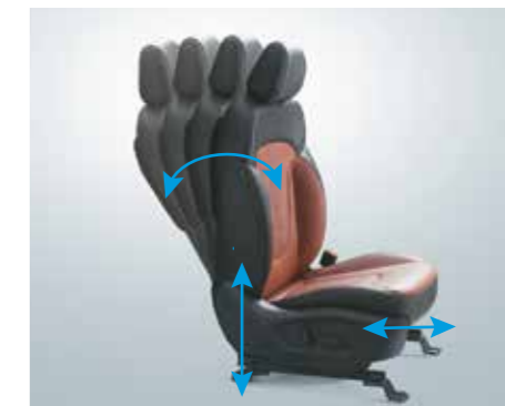
Power driver seat - 8 way