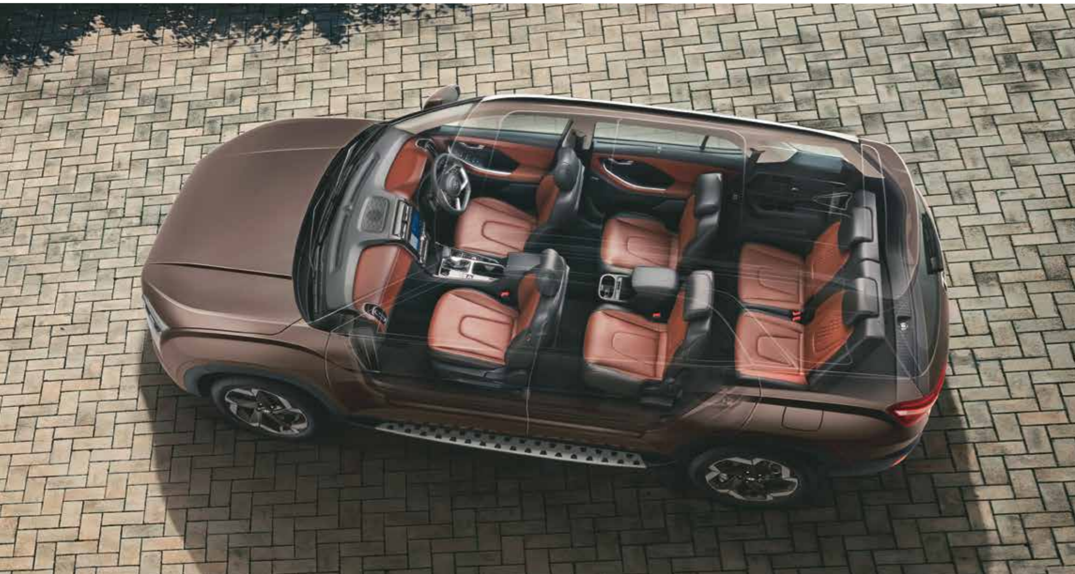
Leather pack: Perforated D-cut steering wheel | Perforated gear knob | Cognac brown and black seat upholstery | Door armrest

The interior of the Hyundai ALCAZAR immerses you in uncluttered design. Complete with premium dual tone cognac brown interiors, the 64 colours ambient lighting offers a regal touch to the cabin. Carefully selected materials accentuate the aesthetic, complete with Hyundai ALCAZAR's advanced technology, ensuring that your entertainment knows no bounds. Experience serenity thanks to a voice controlled panoramic sunroof and an auto healthy air purifier. The tranquil sanctuary is also outfitted with an HD touchscreen system with powerful Bose premium sound system, immersing you in a rich and balanced premium audio experience.