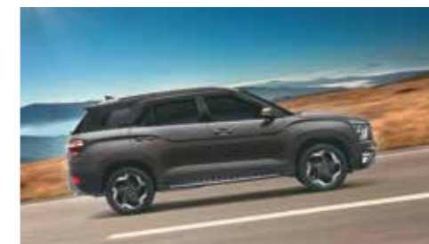
Hill start assist control (HAC)