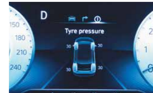
Tyre pressure monitoring system (Highline)