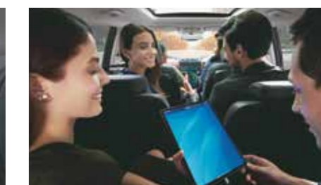
4 USB chargers for 3 rows