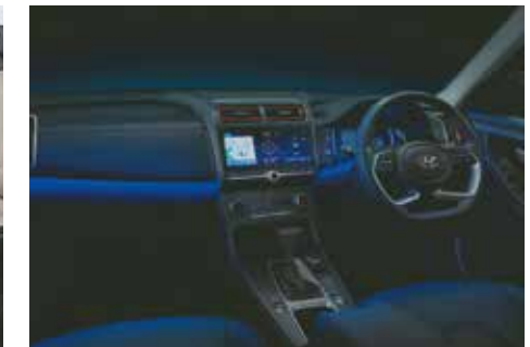
Soothing blue ambient lighting