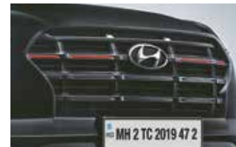
Black gloss radiator grille with red insert