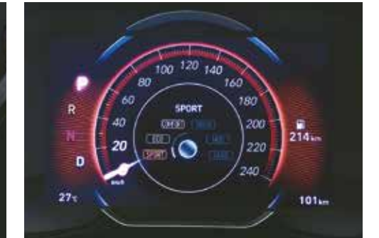
Drive mode select (eco, comfort & sport)