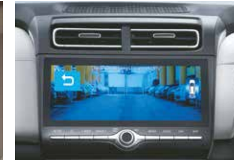
Driver rear view monitor