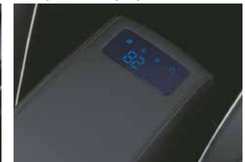
Auto healthy air purifier

Other features: Leather wrapped D-cut steering wheel | Leather TGS knob | Automatic headlamps | Smartphone wireless charger | Electro chromic mirror (ECM) | Door scuff plates – metallic | Rear window sunshade | Power driver seat - 8 way | Cruise control | 2-step reclining rear seat | 60:40 split rear seat