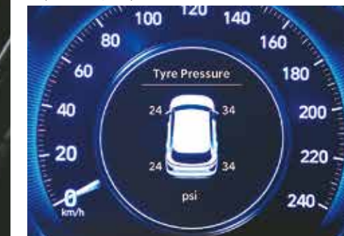
Tyre pressure monitoring system (TPMS)