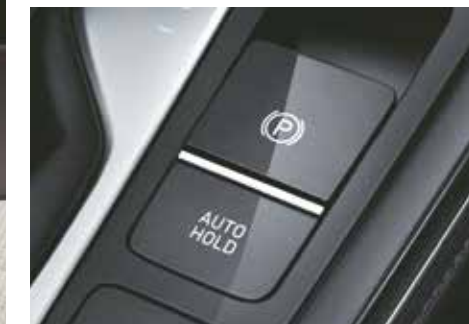
Electric parking brake with auto hold