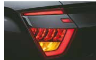
LED tail lamps