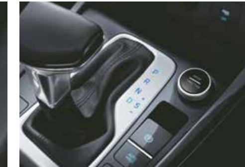
7-speed DCT, 6-speed automatic transmission & IVT