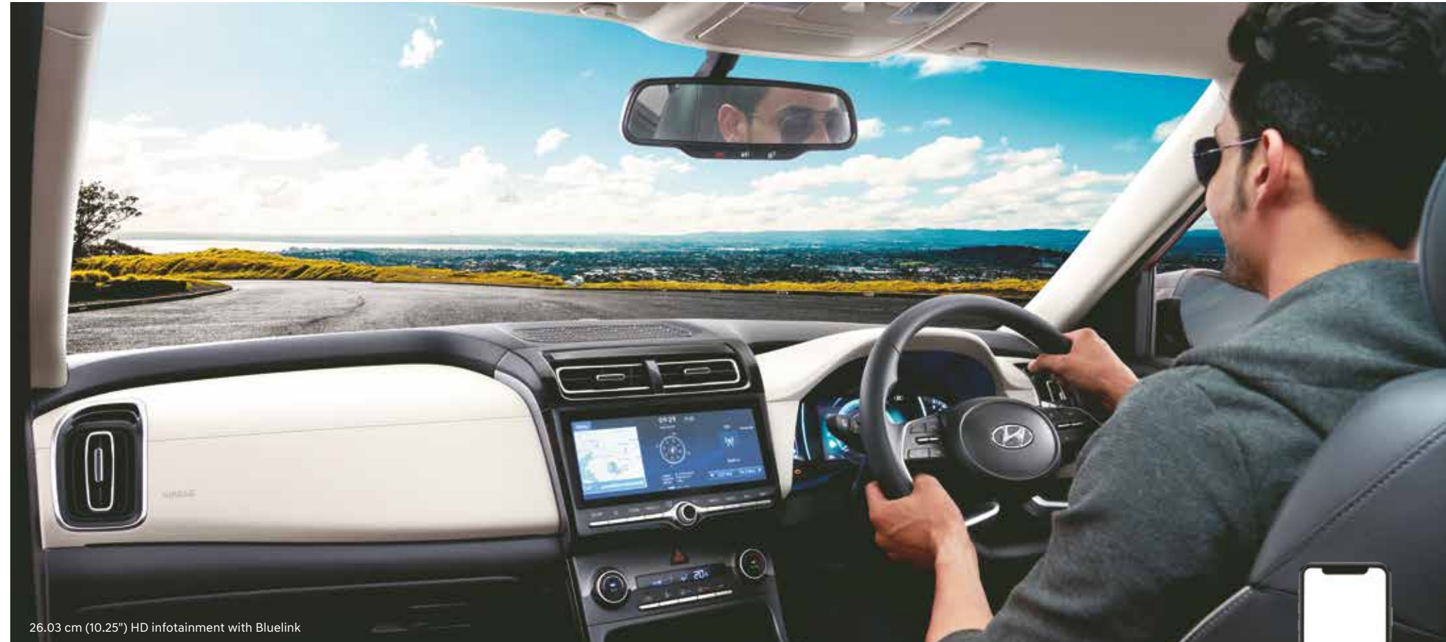
26.03 cm (10.25") HD infotainment with Bluelink

Other features: Remote engine start/stop (AT/DCT & MT) | Remote air purifier on* | Stolen vehicle tracking, notification & immobilization* Monthly health report | Connected car features in smart watch app* | Voice operated open/close sunroof*