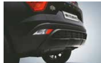
Black gloss front and rear skid plate