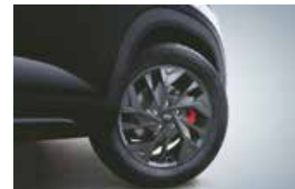
Red front brake callipers

Other features: Body colour outside door handles | Phantom black shark fin antenna | Black gloss roof rails and outside rear view mirror