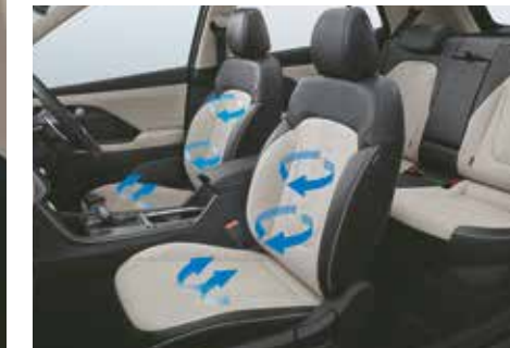
Front row ventilated seats