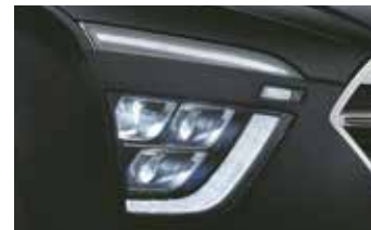
Trio beam LED headlamps with crescent glow LED DRLs