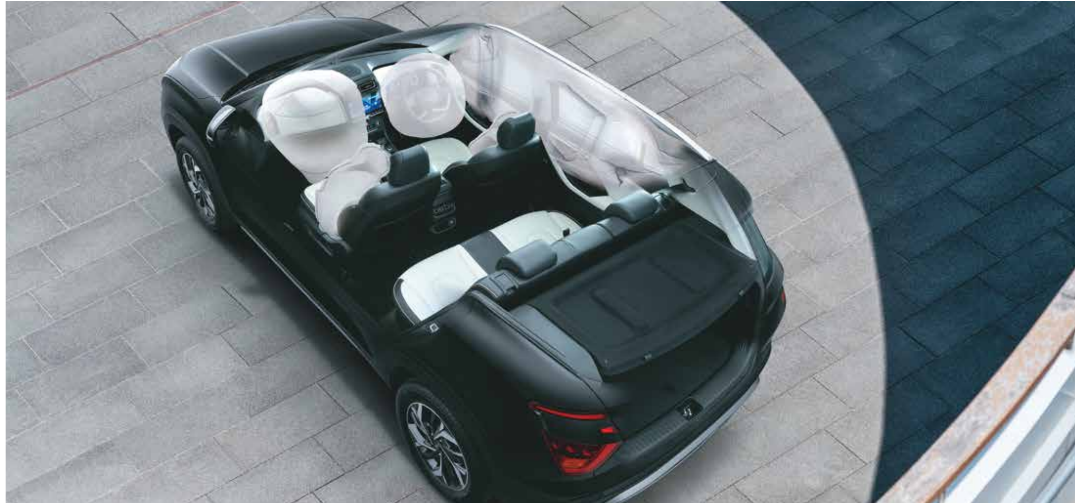
Six airbags (driver, passenger, side & curtain) The image is only for airbag reference and car specifications shown may vary from the actual specifications

Other features: Rear camera with steering adaptive parking guidelines | Child seat anchor | Speed alert system | Rear defogger with timer | ESS Impact sensing auto door unlock | Speed sensing auto door lock | Electronic stability control (ESC) | Vehicle stability management (VSM) | Rear disc brakes Hill start assist control (HAC) | Strong body structure with AHSS | Rear parking sensors with camera