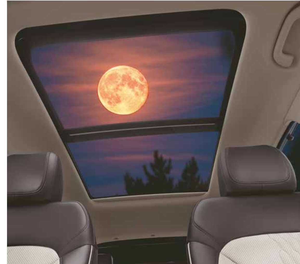
Voice enabled smart panoramic sunroof

Savor the awe inspiring beauty all around when you get in the all-new Creta. The plush new interiors give you the advantage of extra comfort on every ride. Breathe in the wonders of nature and relish exquisite scenic views as you make your way across all terrains of life.