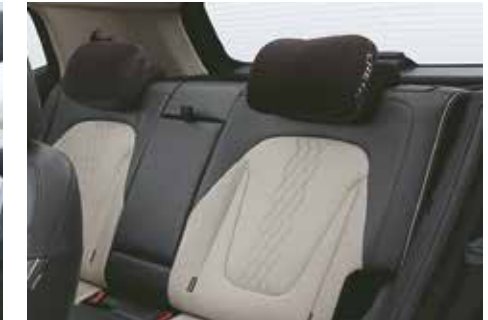
Rear seat headrest cushion