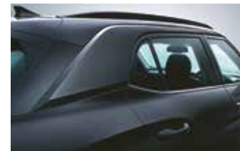
Black gloss C-pillar garnish