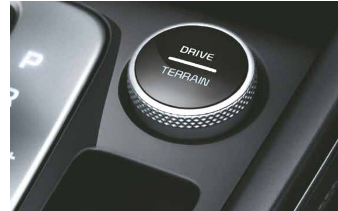
Traction control mode (snow, sand, mud)

With the new 1.4l petrol, 1.5l petrol and 1.5l diesel BS6 engines under the hood, the all-new Creta delivers a power packed performance on every terrain. Be it on the road or off it, the all-new Creta has the dynamism to go the distance.