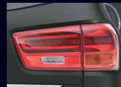
LED Tail Lamps The rear Tail Lamps are complete stunners that make the Carnival look even more premium from the back.