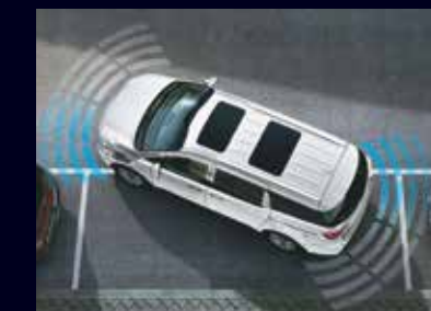
Front and Rear Parking Sensors As Standard These sensors help you to safely manoeuvre and park in peculiar Indian conditions.