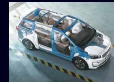
6 Airbags As Standard Our multi-directional safety package includes driver, passenger, side, and curtain airbags.

Its stance tells you in no uncertain terms that it's dynamic and ready to rumble. Hop into the cockpit, fire the 200 ps Engine, put the 8-speed Sportsmatic Transmission through the paces, and enjoy the aggressive performance. You'll agree that the Carnival is as exhilarating as it's extravagant.