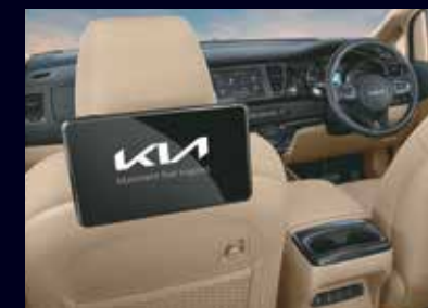
Dual Touchscreen Rear Seat Entertainment System 25.65 cm (10.1") Settle into the lap of luxury and enjoy in-built OTT apps.

Just because you are in the last row doesn't mean that your comfort comes last. It is with this philosophy that the 3-row seating in the Kia Carnival has been designed. The result is extravagant comfort and luxurious experience from the front to the back.