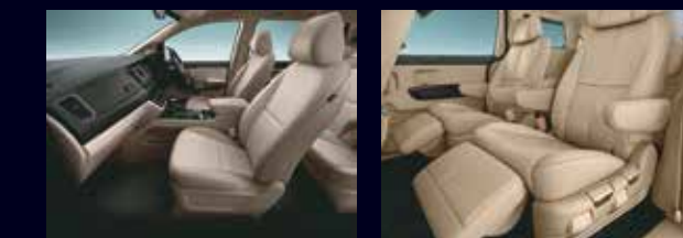
Premium Leatherette Seats (Prestige 7 Seater)