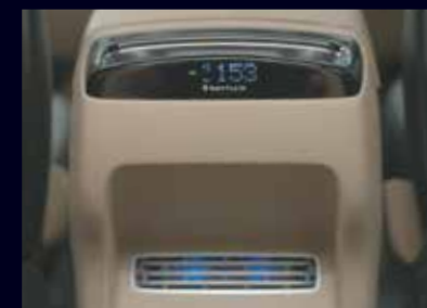
Smart Pure Air Purifier with Virus Protection** The on-board air purifying system keeps the cabin air unaffected by the pollution outside.