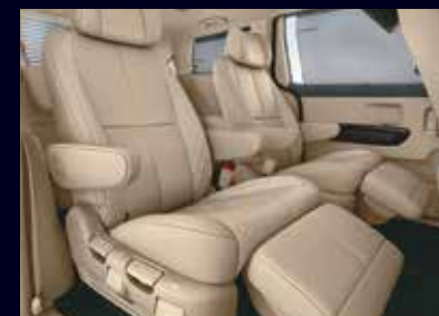
VIP seats with Premium Leatherette The soft, full-grain, premium quality leatherette along with leg support of VIP seats, offer ultimate comfort.