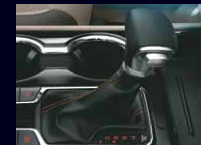
8-Speed Sportsmatic Transmission (8AT) Enjoy superior driving pleasure and dynamic performance with this transmission, which is one of its kind.