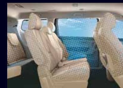
Tri Zone Automatic Temperature Control Every row is assured of absolute comfort, thanks to independent controls for temperature and airflow.