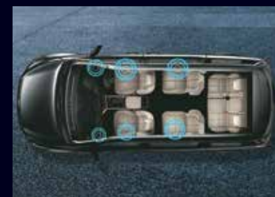
6-speaker Sound System Let the premium 6-speaker sound system immerse you in an extravagant surround experience.