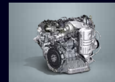
2.2 l Diesel Engine with 200 ps and 440 Nm Torque BS-6 compliant 2.2 l Diesel Engine is packed with power and performance.