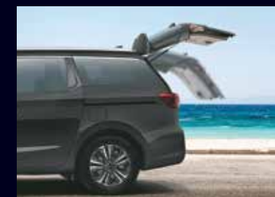
Smart Power Tailgate With the smart key in your pocket, you can open the tailgate even when your hands are full.