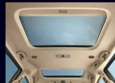
Dual Panel Electric Sunroof As Standard The dual sunroof lets in sunlight and unveils a slice of the big, blue sky for passengers in every row.

Look at it any way, it is extravagance on four wheels. The aggressive front blends effortlessly with the sweeping shoulder lines that glide over the electric sliding doors, culminating in an exciting tail section. It's bold and beautiful at the same time.