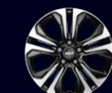
R18 - 45.72 cm (18") Crystal-cut Alloy Wheels