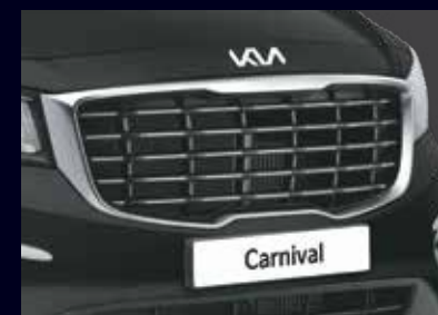
Signature Tiger Nose Grille The Tiger Nose Grille lends a wild yet unique look, and also adds a dash of aggressive attitude to the exterior.