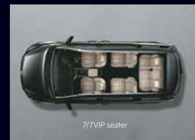
Seat Configuration Comes with two 7 seater options, for all kind of needs.