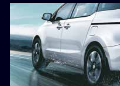
Electronic Stability Control As Standard It controls brake pressure in challenging driving situations like sudden turns, acceleration, and braking.