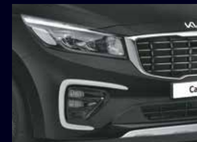
LED Headlamps & LED Ice Cube Fog Lamps The aesthetically crafted Headlamp Cluster & Ice Cube Shaped Fog Lamps give the vehicle a distinctive character.