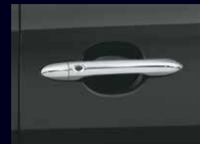
One Touch Power Sliding Rear Doors With just the touch of a button, the door to the second row slides open automatically, or as we say, magically!