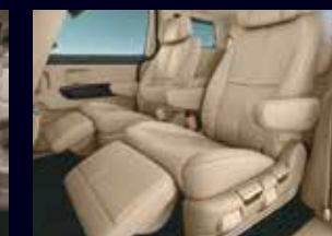
Premium Leatherette VIP Seats (Limousine and Limousine Plus 7 Seater)