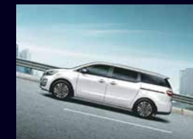
Hill Start Assist Control As Standard Hill Start Assist Control prevents the vehicle from rolling back during uphill climb from a static position.